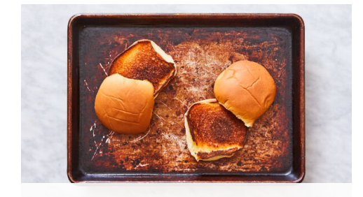
4. Toast buns

In a medium skillet, heat 2 teaspoons oil over medium-high. Add chicken ; cook, breaking up into large pieces, until browned and cooked through, 3-4 minutes. Add barbecue sauce ; bring to a simmer and cook, stirring occasionally, 1-2 minutes. Season to taste with salt and pepper .