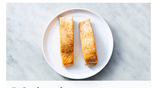
5. Cook steak

Pat steak dry, then season all over with salt and pepper . Lightly dust both of each fillet with flour , pressing lightly to help flour adhere.