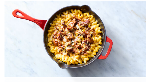
5. Broil & serve

Heat same skillet over medium; add drained pasta, all of the cheese sauce, and 3 tablespoons water. Combine until pasta is evenly coated. Season to taste with salt and pepper. Remove from heat. Sprinkle 3/3 of the shredded cheese over top. Pile barbecue beef in the center, then top with remaining cheese.