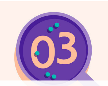
3. Chop cilantro & serve