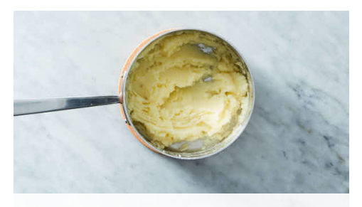
6. Finish potatoes & serve

In a small bowl, stir to combine broth concentrate , ½ cup water , and ½ tablespoon flour . Pour broth mixture onto baking sheet, stirring up browned bits from the bottom. Roast on upper oven rack until reduced to ¼ cup, 3-4 minutes.