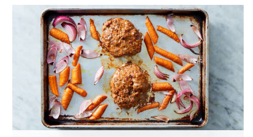
4. Roast meatloaf & veggies

To bowl with grated garlic, add beef, Dijon, chopped thyme leaves, finely chopped onions, ½ cup panko, 1 large egg, 2 tablespoons of the Worcestershire sauce, 2 tablespoons ketchup, ½ teaspoon salt, and a few grinds of pepper. Mix gently to combine, and then shape beef into into 2 equal-size ovals.