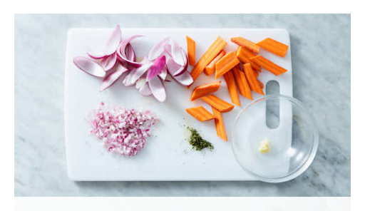
2. Prep ingredients

Preheat oven to 450°F with rack in upper third. Peel potato , then cut into 1-inch pieces. Place potatoes in a medium saucepan with 1 teaspoon salt and enough water to cover by 1 inch. Cover and bring to a boil over high heat. Uncover; cook until easily pierced with a fork, 9-10 minutes. Reserve ½ cup cooking water ; drain potatoes and return to saucepan. Cover to keep warm.