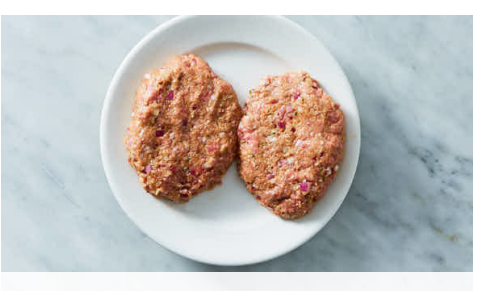
3. Season beef

Halve carrots lengthwise, then cut into 2-inch pieces. Pick and finely chop 1 teaspoon thyme leaves , discarding stems. Peel and finely grate ½ teaspoon garlic into a medium bowl. Peel and quarter onion ; finely chop ¼ of the onion (about ¼ cup) then cut remaining quarters in half and separate into pieces.