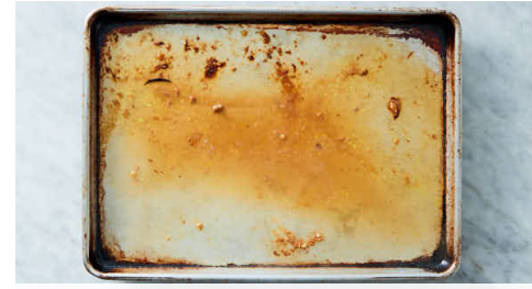
5. Make gravy

Add carrots and onions to a rimmed baking sheet. Toss with 1 tablespoon oil ; season with salt and pepper . Push vegetables to outer edges of baking sheet; place meatloaves in center. Bake on upper oven rack until meatloaves reach an internal temperature of 165°F and vegetables are tender, 20-22 minutes. Transfer meatloaves and vegetables to a plate; cover to keep warm.