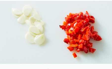
2. Prep ingredients

Heat 1 tablespoon oil in a large skillet over medium-high. Add sausage and cook, breaking up large pieces with a spoon, until browned, about 5 minutes.