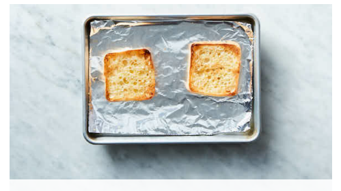
6. Make garlic bread & serve

Add spinach to the skillet. Cook, stirring occasionally, until spinach is wilted, about 2 minutes. Season to taste with salt and pepper . Return chicken and any juices back to skillet, then keep warm over low heat. Preheat broiler with top rack 6 inches from heat source.