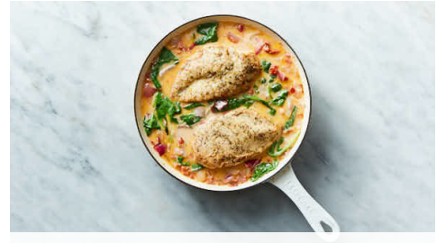
5. Add spinach

Heat 1 tablespoon oil in same skillet over medium. Add onions and cook, stirring, until softened, about 6 minutes. Add sundried tomatoes and % teaspoon of the chopped garlic ; cook, stirring, until fragrant, 30 seconds. Stir in chicken broth concentrate and % cup water . Bring to a simmer; cook, scraping up browned bits, until reduced by ½ , 3 minutes. Stir in mascarpone .