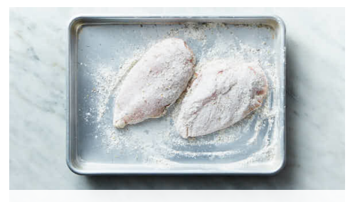
2. Season chicken

Set 1 tablespoon butter out at room temperature to soften until step 6. Finely chop 1 teaspoon garlic. Cut all of the onion into 1-inch pieces. Coarsely chop sun-dried tomatoes.