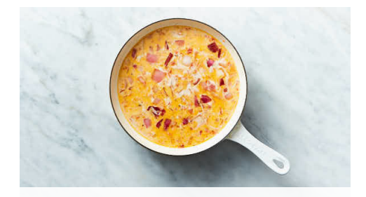
4. Start sauce

Heat 1 tablespoon oil in medium skillet over medium-high. Add chicken to skillet; cook until lightly browned on both sides and cooked through, about 3 minutes per side. Transfer to a plate.