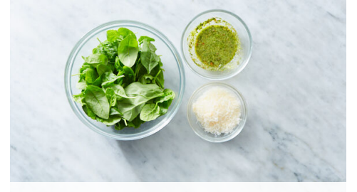
5. Make salad

Bake pizza on bottom oven rack until dough is browned and cheese is bubbling, 12-18 minutes (watch closely as ovens vary).