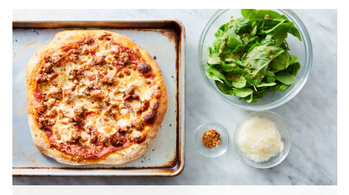
6. Finish & serve

Transfer pizza to a cutting board and cut into squares. Sprinkle pizza and salad with Parmesan . Serve pizza with remaining pesto and crushed red pepper , with spinach salad alongside. Enjoy!