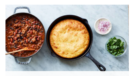
6. Garnish & serve

Bake cornbread on upper oven rack until golden, risen, and a toothpick inserted in the center comes out with just a few moist crumbs, about 15 minutes.