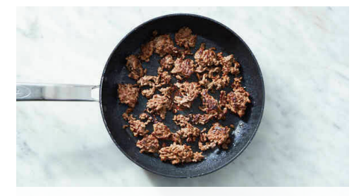
5. Cook beef

Remove from oven. Carefully stir lime zest and remaining cilantro into cauliflower directly on baking sheet.