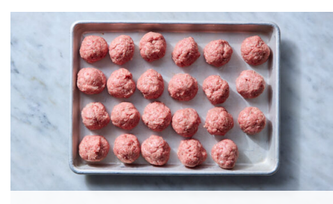
1. Make meatballs

Nutrition per serving Calories 980kcal, Fat 42g, Carbs 93g, Protein 49g