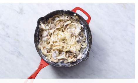
3. Cook mushrooms

Heat 1 tablespoon oil in a large skillet over medium-high. Add meatballs and cook, turning once or twice, until browned in spots, 4–5 minutes. Transfer to slow cooker.