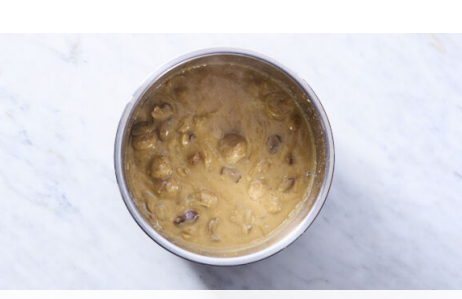
4. Slow cook stroganoff

Serve stroganoff over egg noodles and sprinkle with chives . Enjoy!