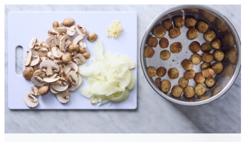
2. Brown meatballs

Into a large bowl, coarsely grate half of the onion . Add beef, panko, half of the mushroom seasoning, 1 large egg , and 1 teaspoon each of salt and pepper . Knead until combined. Shape into 1½inch wide meatballs.