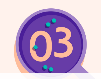
3. Finish meat sauce

Heat 1 tablespoon oil in a medium ovenproof skillet over medium-high. Add sausage and a pinch of salt ; cook, breaking up into smaller pieces, until browned, 3–5 minutes. Stir in garlic and 1 teaspoon of the Italian seasoning ; cook, 1 minute more. Pour off all but 1 tablespoon fat from skillet.