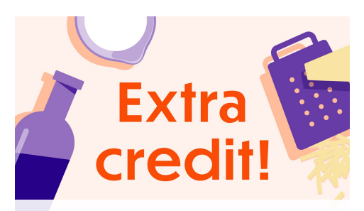
6. Did you know?

Drizzle oil over lasagna , then broil on top oven rack until ricotta mixture is goldenbrown and bubbling, 2–3 minutes (watch closely). Allow lasagna to rest 5 minutes before cutting and serving. Enjoy!