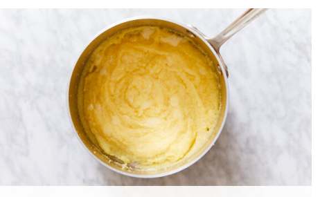
3. Make polenta

On a rimmed baking sheet, toss Brussels sprouts with 2 tablespoons each of oil and vinegar, any remaining whole rosemary sprigs, and a generous pinch each of salt and pepper. Roast on upper oven rack until golden brown and tender, about 15 minutes.