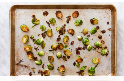
2. Roast Brussels sprouts

Preheat oven to 450°F with a rack in the upper third. Trim and discard stem ends from Brussels sprouts , then halve (or quarter, if large); remove outer leaves, if necessary. Pick and finely chop 2 teaspoons rosemary leaves , discarding stems (save rest for own use). Finely chop half of the shallot . Finely chop 1 teaspoon garlic .