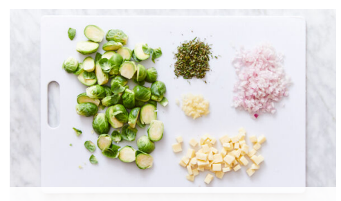
1. Prep ingredients

Calories 790kcal, Fat 42g, Carbs 53g, Protein 58g