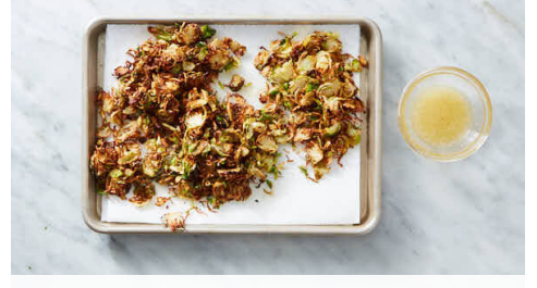
5. Toss Brussels sprouts

Cook, stirring, until crispy, 2–3 minutes (be careful, it may splatter!). Using a slotted spoon, transfer to a paper towellined plate; season with salt . Repeat with remaining Brussels sprouts, adjusting heat as needed.