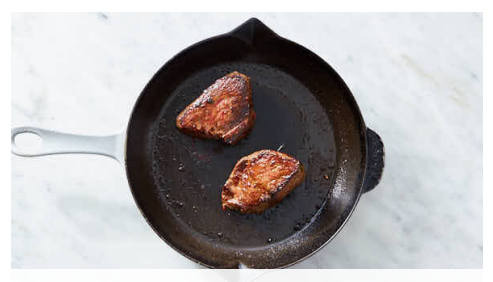
3. Sear steaks

Finely grate ½ teaspoon garlic. Trim Brussels sprouts , then thinly slice. Thinly slice scallions , keeping dark greens separate.