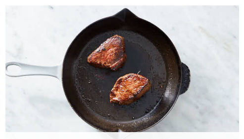
3. Sear steaks

Finely grate ½ teaspoon garlic. Trim Brussels sprouts , then thinly slice. Thinly slice scallions , keeping dark greens separate.