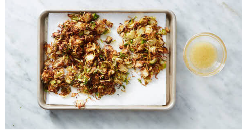
5. Toss Brussels sprouts

Cook, stirring, until crispy, 2–3 minutes (be careful, it may splatter!). Using a slotted spoon, transfer to a paper towellined plate; season with salt . Repeat with remaining Brussels sprouts, adjusting heat as needed.