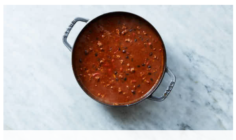
3. Simmer chili

Heat 1 tablespoon oil in a medium Dutch oven or pot over medium-high. Add beef and a generous pinch of salt . Cook, breaking up meat into smaller pieces, until browned, 5-8 minutes. Add garlic, taco seasoning , and % of the onions . Cook, stirring occasionally, until onions are softened, about 5 minutes. Stir in % cup tomato paste and cook, about 1 minute.