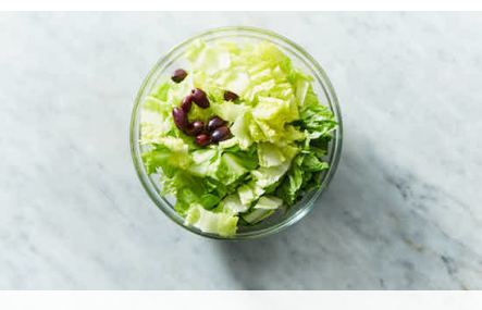
2. Make vinaigrette & salad

Preheat broiler with a rack 6 inches from heat source. Peel cucumber , halve lengthwise, spoon out the seeds, and thinly slice crosswise into half-moons. Finely chop 1 teaspoon garlic . Core tomato , then cut into ½-inch pieces.