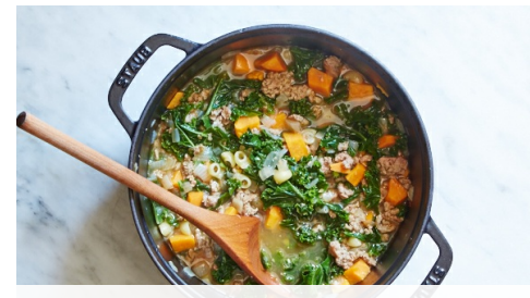
5. Add pasta & kale

Add sweet potatoes, 3½ cups water, and all of the chicken broth concentrate; stir, cover, and bring to a boil.