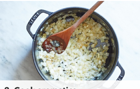
2. Cook aromatics

Coarsely chop onion . Finely chop 1 teaspoon garlic . Peel sweet potato , then cut into ½-inch pieces. Strip kale leaves from stems, then chop leaves into bite-sized pieces, discarding stems.