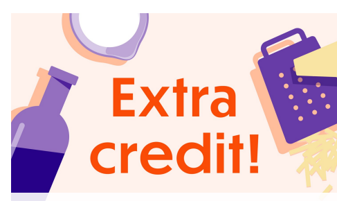
6. Take it to the next level

Top Mediterranean chicken pitzas with marinated cucumbers, sour cream, and a drizzle of oil. Enjoy!