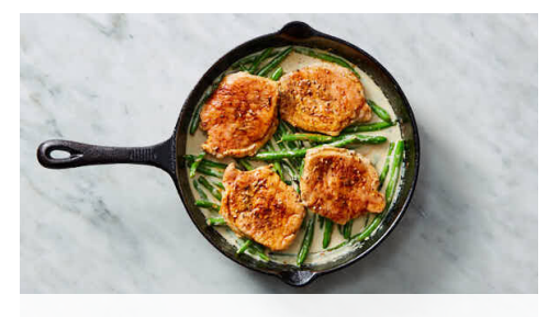
5. Build sauce

Heat 1 tablespoon oil in a medium ovenproof skillet over medium-high. Add green beans and cook until tender and browned in spots, about 5 minutes. Season with a pinch each of salt and pepper . Transfer to bowl and cover to keep warm.