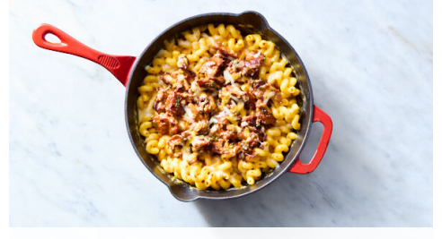
5. Broil & serve

Heat same skillet over medium; add drained pasta, all of the cheese sauce, and 3 tablespoons water. Combine until pasta is evenly coated. Season to taste with salt and pepper. Remove from heat. Sprinkle 3/3 of the shredded cheese over top. Pile barbecue chicken in the center, then top with remaining cheese.