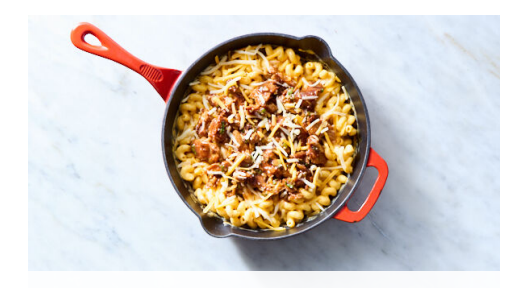
4. Make mac & cheese

Add 1 teaspoon oil and remaining scallions to skillet. Cook, stirring, until fragrant, about 1 minute. Add ¼ cup water and bring to a simmer, scraping up bits from the bottom of the pan. Add to bowl with chicken. Stir in barbecue sauce until evenly coated.