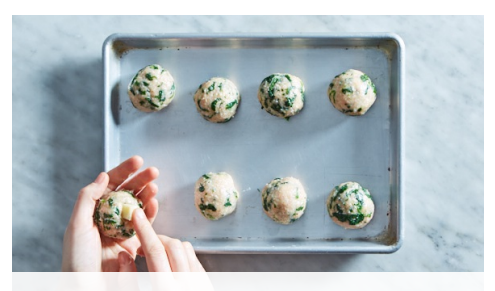
3. Make meatballs

Heat 1 teaspoon oil in a medium ovenproof skillet (preferably nonstick) over medium-high. Add half of the spinach , ½ of the chopped garlic, and 1 tablespoon water ; cook, stirring, until wilted, 1-2 minutes. Transfer to a finemesh sieve and press out excess liquid. Coarsely chop wilted spinach on a cutting board, then transfer to a medium bowl.