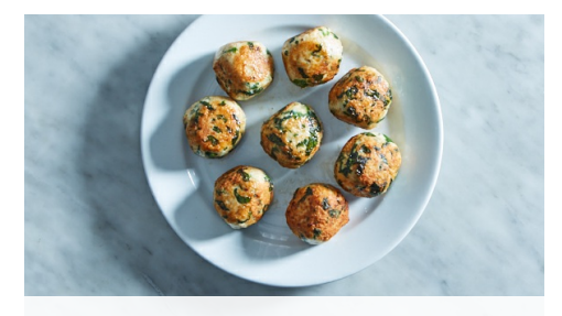
4. Brown meatballs

To bowl with cooked spinach , add beef , panko , 1 large egg , 1 tablespoon oil , % teaspoon salt , and % teaspoon pepper . Gently knead to combine. Using lightly moistened hands, form into 8 meatballs. Evenly divide fontina between meatballs, press cheese into the center of each meatball, then cover over cheese, reforming the beef mixture into a ball.