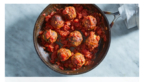
5. Braise meatballs

Heat 2 tablespoons oil in the same skillet over medium-high. Add meatballs and cook, turning occasionally, until browned but not cooked through, about 6 minutes. Transfer to a plate leaving, oil in the skillet. Stir remaining garlic and 1 teaspoon harissa spice (or less, if desired) into same skillet; cook for 10 seconds.