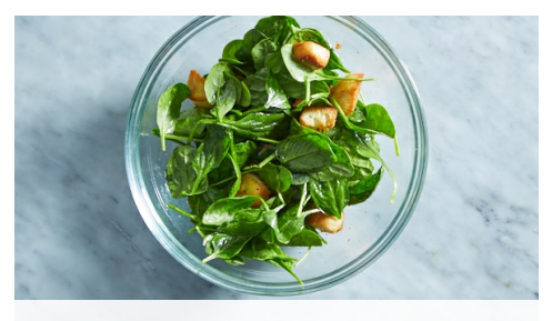
6. Make salad & serve

Add tomatoes and juices, ½ cup water, ½ teaspoon salt, several grinds of pepper, and ½ teaspoon sugar. Boil for 2 minutes. Add meatballs; turn to coat. Braise on center oven rack, turning meatballs once, until an instant read thermometer reaches 155°F when inserted into the center of the meatballs, and sauce is thickened, 15–20 minutes.