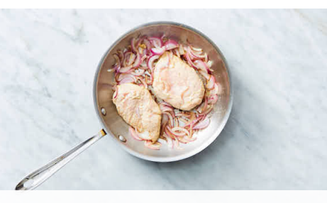
4. Brown steak & onions

Finely grate all of the lime and orange zest . Add half each of the lime and orange zest to bowl with bean mixture. In a medium bowl, combine mayonnaise and remaining lime and orange zest.