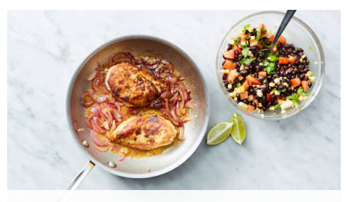
6. Finish & serve

Flip pork , then squeeze all of the orange juice into skillet. Partially cover and cook over medium-high heat until pork is cooked through and pan sauce is reduced by half, 3-4 minutes.