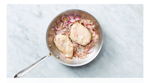
4. Brown pork & onions

To bowl with mayonnaise , stir in 2 teaspoons each of cumin and salt and a few grinds of pepper . Pat pork dry, then add to mayonnaise mixture and turn well to coat.