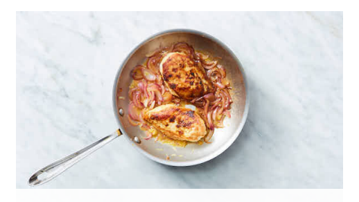
5. Simmer pork

Heat 1 tablespoon oil in a large skillet over medium-high. Add pork and cook until golden brown on the bottom, 2-3 minutes. Scatter onions around pork in skillet and season with ¼ teaspoon cumin and a pinch of salt . Cook over medium-high heat until onions are just starting to brown, 1-2 minutes more.