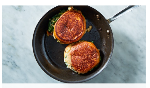
6. Finish & serve

Heat 1½ tablespoons oil in a medium nonstick skillet over medium-high. Add chopped garlic, artichokes, and a pinch of crushed red pepper (or more depending on heat preference); season with salt and pepper. Cook, stirring, until garlic is fragrant and artichokes start to brown, about 4 minutes.