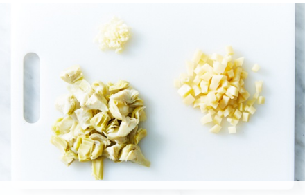
2. Prep ingredients

Meanwhile, finely chop 2 teaspoons garlic. Drain half of the artichokes and coarsely chop (save rest for own use). Cut mozzarella into ½-inch cubes.