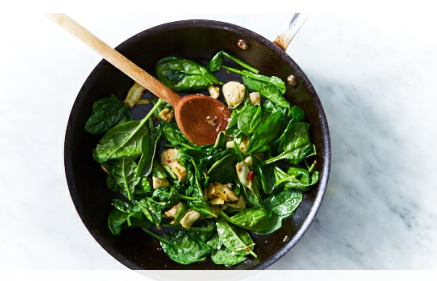
4. Wilt spinach

Preheat oven to 425°F with a rack in the center. Scrub sweet potato , then cut into ½-inch thick wedges. On a rimmed baking sheet, toss sweet potatoes with 1 tablespoon oil and season with salt and pepper . Roast on center oven rack until brown and tender, tossing halfway through, about 20 minutes total.