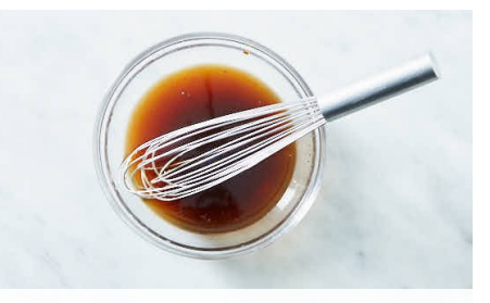
3. Prep sauce

Heat 1 tablespoon oil in a medium skillet over medium-high. Add onions and peppers . Season with salt and a few grinds of pepper . Cook, stirring occasionally, until onions are golden and both onions and peppers are slightly tender, 4-5 minutes. Transfer to a medium bowl. Wipe out skillet and reserve for step 4.