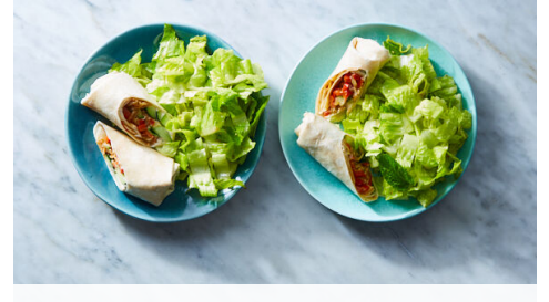
6. Make salad & serve

Place tortillas on a work surface. Evenly divide hummus among them. Top with some whole mint leaves and a sprinkle of za'atar . Place beef strips , cooked veggies , and some of the cucumber over top. Tightly roll into a cylinder, tucking in edges to keep filling from spilling out.