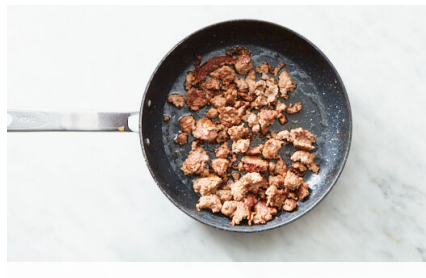
2. Brown beef

Heat 1 tablespoon oil in a medium skillet over medium-high. Add beef and a pinch each of salt and pepper . Cook, breaking beef up into smaller pieces, until well browned, 5-7 minutes.