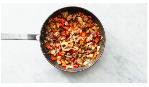
3. Cook veggies

Heat 1 tablespoon oil in a medium skillet over medium-high. Add beef and a pinch each of salt and pepper . Cook, breaking beef up into smaller pieces, until well browned, 5-7 minutes.