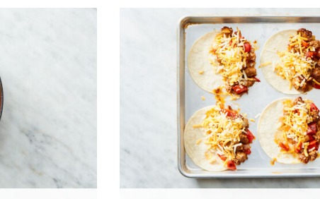
5. Build quesadillas

If skillet looks dry, add another tablespoon oil . Add bell peppers and onions to skillet with beef . Season with a pinch each of salt and pepper . Cook, stirring occasionally, until veggies are tender, 7-9 minutes. Add taco seasoning and cook until fragrant, about 30 seconds.