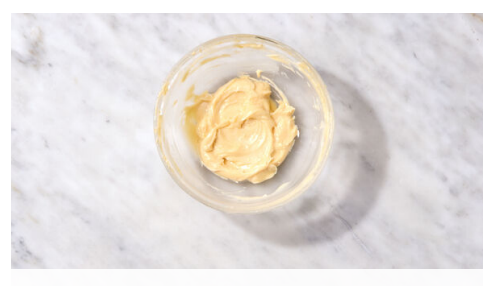
5. Make hot honey butter

Meanwhile, in a large bowl, whisk together ranch dressing , 1 tablespoon each of vinegar and sugar , and ½ teaspoon pepper . Add cabbage blend and mix well; season to taste with salt and pepper. Refrigerate until ready to serve.