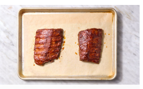
3. Bake ribs

Add 1 tablespoon butter to preheated skillet; swirl to coat. Add batter ; smooth top with a spatula. Bake on center oven rack until toothpick inserted into center comes out dry, 25-30 minutes.