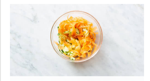
4. Marinate cucumbers

Transfer to a medium bowl and toss with half of the hoisin sauce and 1 tablespoon water. Season to taste with salt and pepper.