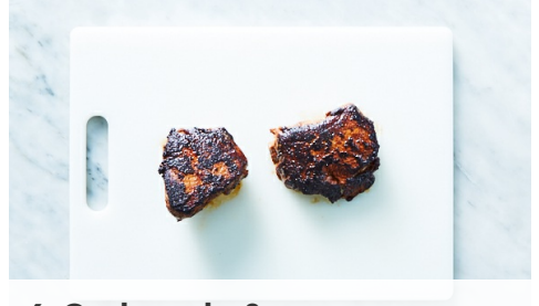
6. Cook steaks & serve

In same bowl, whisk to combine mustard , 2 tablespoons oil , 2 teaspoons vinegar , and ½ teaspoon sugar . Add potatoes , snap peas , and sliced raw scallions ; toss to combine. Season to taste with salt and pepper .