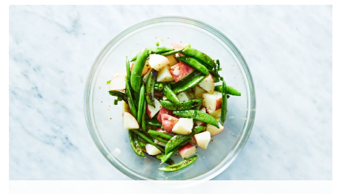
5. Make potato salad

Return same skillet to medium-high heat. Add snap peas and a drizzle of oil ; season with salt and pepper . Cook, stirring occasionally, until crisp-tender and charred in spots, 3-4 minutes.