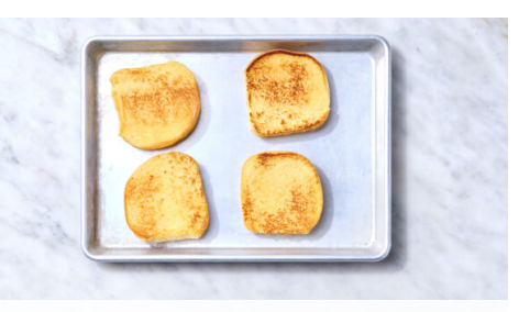
3. Toast buns

Wrap the bottom of a small saucepan with plastic. Meanwhile, thinly slice 2 lettuce leaves (save rest for own use). Thinly slice onion (slice as thinly as possible; use a mandoline if available). Divide lamb into 4 even balls; gently press each ball into a 3-inch patty. Season both sides with salt and pepper .