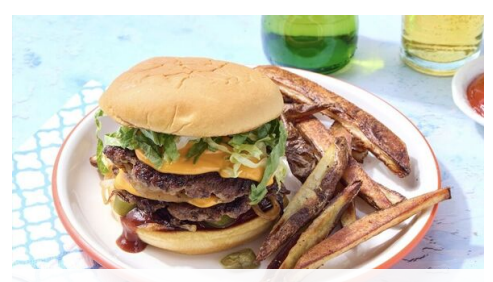
6. Finish & serve

Cook patties undisturbed until edges are dark brown and crusty, 1-2 minutes. Using a stiff spatula, lift patties from skillet, making sure to scrape off as much browned meat as possible. Flip patties, onion side down ; lower heat to medium. Spread 1 tablespoon Velveeta on top of each patty. Continue cooking until the onions are browned along the edges, 2-3 minutes.