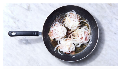
4. Smash burgers

In a large heavy skillet (preferably cast iron), melt 2 tablespoons butter over medium. Add buns , cut side down; swirl around skillet to absorb butter. Cook until light golden-brown and toasted, 1-2 minutes. Remove from skillet; wipe skillet clean. Right before cooking burgers, spread barbecue sauce on cut sides of buns. Arrange jalapeños on bottom buns.