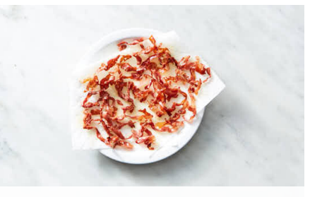
3. Cook prosciutto

Add pasta to boiling water and cook, stirring often to prevent sticking, until al dente, about 12 minutes. Add peas and cook until bright green, about 30 seconds. Reserve 1 cup cooking water , then drain pasta and peas.