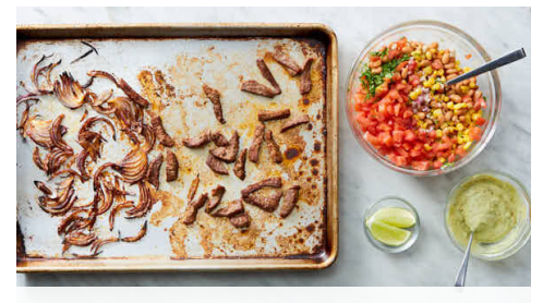
5. Finish & serve

Broil on upper oven rack, tossing halfway through, until charred in spots and beef is just cooked through, 3-4 minutes (watch closely as broilers vary).