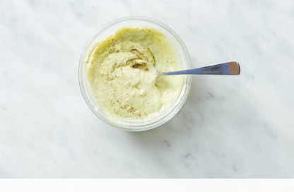
4. Make avocado crema

Meanwhile, to bowl with remaining lime juice , add guacamole and sour cream ; stir to combine. Season to taste with salt and pepper .