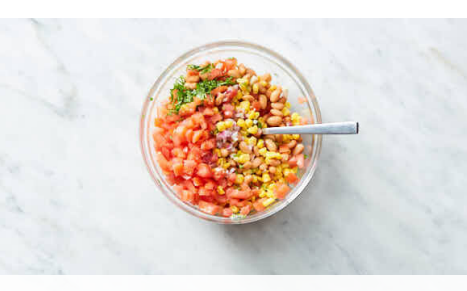
2. Make bean salsa

Meanwhile, to bowl with remaining lime juice , add guacamole and sour cream ; stir to combine. Season to taste with salt and pepper .