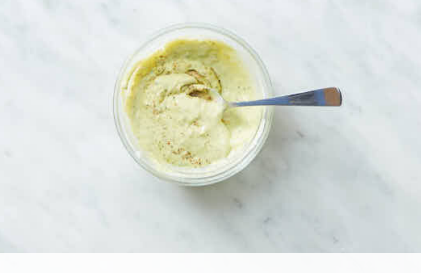
4. Make avocado crema

Meanwhile, to bowl with remaining lime juice , add guacamole and sour cream ; stir to combine. Season to taste with salt and pepper .