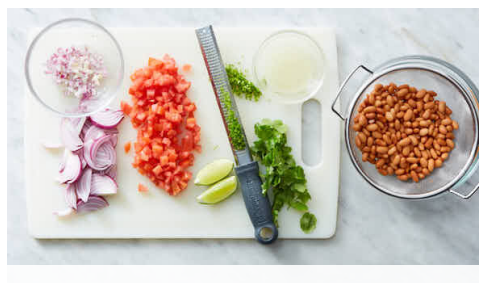
1. Prep ingredients

Calories 560kcal, Fat 24g, Carbs 54g, Protein 34g