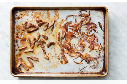
3. Broil beef & onions

In a medium bowl, add beans, tomatoes, corn, chopped onions, <sup>2</sup>/<sub>3</sub> of the cilantro, 1 tablespoon of the lime juice , and 1 tablespoon olive oil ; stir to combine. Season to taste with salt and pepper .