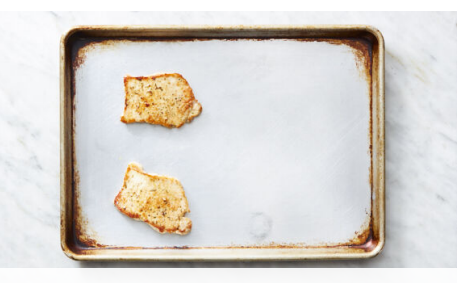
3. Brown pork chops

Trim ends from green beans . Cut shallot through the root end into quarters and separate into wedges. Pick and finely chop 1 teaspoon rosemary leaves , discarding stems. In a small bowl, combine half of the rosemary , % teaspoon salt , and a few grinds of pepper .