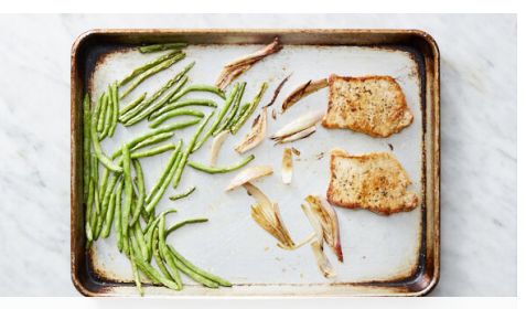
4. Roast green beans & pork

Preheat oven to 450°F with a rack in the center. Peel potatoes , then cut into 1inch pieces. Place in a medium saucepan with 1 teaspoon salt and add enough water to cover by 1 inch. Cover and bring to a boil, then uncover and cook until easily pierced with a fork, about 10 minutes. Reserve ½ cup cooking water , then drain potatoes and return to saucepan. Cover to keep warm off heat.