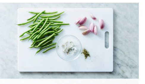
2. Prep veggies & pork rub

On empty side of baking sheet with pork , toss green beans and shallots with 1 tablespoon oil ; season with salt and pepper . Roast on center oven rack until pork reaches an internal temperature of 145°F, about 5 minutes. Transfer to a plate. Return green beans to center rack and roast until tender and browned in spots, about 5 minutes more. Smash 1 large garlic clove .