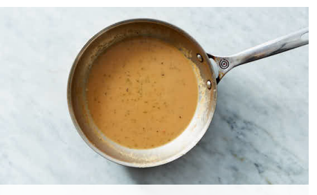
6. Make gravy & serve

Meanwhile, heat potatoes in saucepan over medium. Add 1 tablespoon butter and mash using a potato masher or fork, adding 1 tablespoon reserved water or milk at a time, as needed to reach desired consistency. Season to taste with pepper ; cover to keep warm. In a liquid measuring cup, whisk turkey broth concentrate , ½ cup water , and ½ teaspoon vinegar .