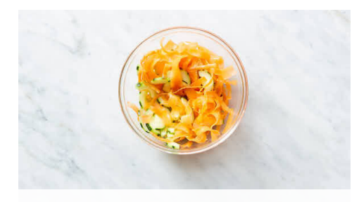
4. Marinate cucumbers

Transfer to a medium bowl and toss with half of the hoisin sauce and 1 tablespoon water. Season to taste with salt and pepper.