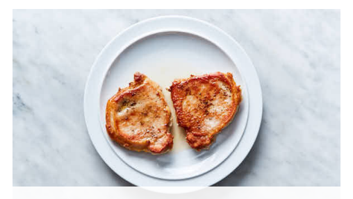
5. Sear chicken

Heat ¼ cup oil in a medium skillet over medium-high until shimmering. Add sliced shallots ; cook, stirring, until golden, 5-7 minutes. Use a slotted spoon to transfer to a paper-towel lined plate.