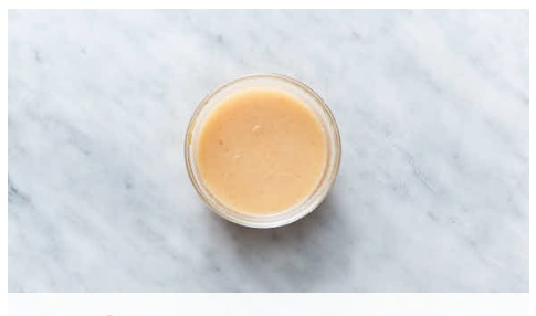
3. Make peanut sauce

Peel and finely chop 1 tablespoon ginger . Thinly slice shallot , then finely chop 1 tablespoon. Halve pepper , discard stem and seeds, then cut into ¼-inch wide strips. Thinly slice cucumber (peel first, if desired). Quarter romaine lengthwise, then cut crosswise into 1-inch pieces; discard stem end. Coarsely chop peanuts .