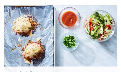
6. Finish & serve

Add remaining marinara sauce to a bowl and cover with a damp paper towel; microwave until warmed through, 1–2 minutes.