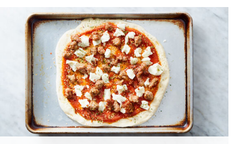
3. Assemble pizza

Generously oil a rimmed baking sheet. On a floured surface, roll or stretch pizza dough into a 12-inch circle. If dough springs back, cover and let sit 5-10 minutes to relax before rolling again. Dust off excess flour; carefully transfer to prepared baking sheet.