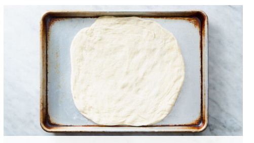
2. Stretch dough

Heat 2 teaspoons oil in a medium nonstick skillet. Add sausage to skillet and cook, breaking the meat up into bitesized pieces with a spoon, until browned in spots, about 4 minutes (sausage will not be totally cooked through).