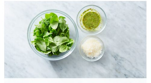
5. Make salad

Bake pizza on bottom oven rack until dough is browned and cheese is bubbling, 12-18 minutes (watch closely as ovens vary).