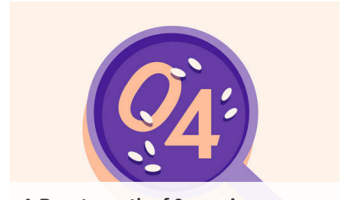
4. Roast meatloaf & veggies

While carrots roast, crumble feta into a medium bowl. Add beef, sun-dried tomatoes, panko, chopped garlic and onions, 1 large egg, ½ teaspoon of salt, and a few grinds of pepper. Gently knead to combine. Divide into 2 equal-sized ovals.