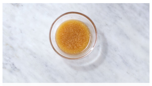
2. Make dressing

Thinly slice half of the onion (save rest for own use). Thinly slice Fresno chili (remove seeds and pith for less spice; use half if desired). Pick mint leaves from stems, tearing large leaves in half; discard stems. Coarsely chop cilantro leaves and stems . Coarsely chop peanuts . Pat chicken dry, then shred into bite-sized pieces.