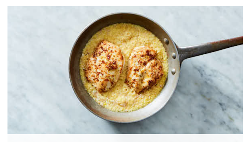
6. Finish & serve

Finely chop 1 teaspoon dill fronds and tender stems together. On a rimmed baking sheet, toss broccoli with chopped dill and 1 tablespoon oil; season with salt and pepper. Bake on upper oven rack until just tender, about 5 minutes. Remove from oven and sprinkle feta over top. Bake on upper oven rack until cheese is golden, 3-5 minutes more.