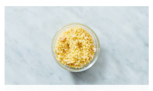
3. Toast couscous

To bowl with orange zest , add 1 teaspoon of the dried oregano , 1 tablespoon oil , 1 teaspoon salt , and a few grinds of pepper , whisking to combine. Pat chicken dry, then pound to ½-inch thickness. Add chicken to marinade and turn to coat. Set aside to marinate until step 4.