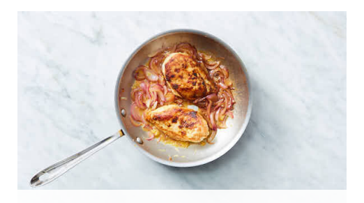
5. Simmer chicken

Heat 1 tablespoon oil in a medium skillet over medium-high. Add chicken and cook until chicken is golden brown on the bottom, 3-4 minutes. Scatter onions around chicken in skillet and season with 1/4 teaspoon cumin and a pinch of salt . Cook over medium-high heat until onions are just starting to brown, 1-2 minutes more.