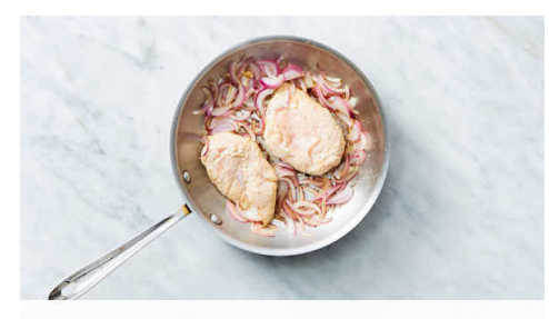
4. Brown chicken & onions

To bowl with mayonnaise, stir in 2 teaspoons each of cumin and salt and a few grinds of pepper. Pat chicken dry, then add to mayonnaise mixture and turn well to coat.