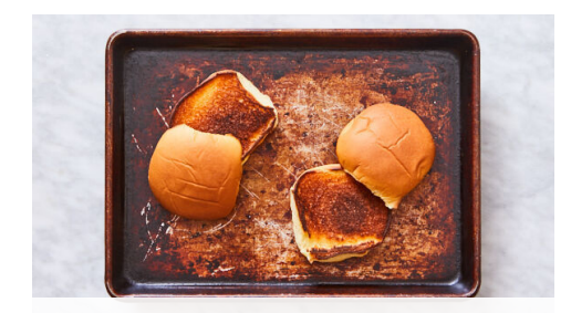
4. Toast buns

In a medium skillet, heat 2 teaspoons oil over medium-high. Add chicken ; cook, breaking up into large pieces, until browned and cooked through, 3-4 minutes. Add barbecue sauce ; bring to a simmer and cook, stirring occasionally, 1-2 minutes. Season to taste with salt and pepper .