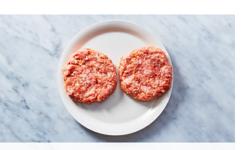
3. Mix & shape burgers

In a large bowl, combine cabbage blend with 1 teaspoon each of salt and sugar . Using your hands, squeeze mixture 10-12 times to soften slightly. Stir in chopped cilantro , sliced scallion greens , and 1 tablespoon rice vinegar .