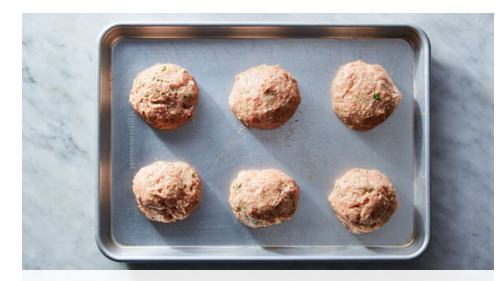
2. Form meatballs

Trim scallions; cut 1 into 2-inch pieces, thinly slice remaining. Finely grate 2 teaspoons ginger; thinly slice remaining. In a large bowl, combine pork, sliced scallions, grated ginger, 1 tablespoon each tamari and mushroom seasoning, ½ tablespoon sesame oil, 2 teaspoons sugar, 1 teaspoon each five spice and salt, and 1 large egg.